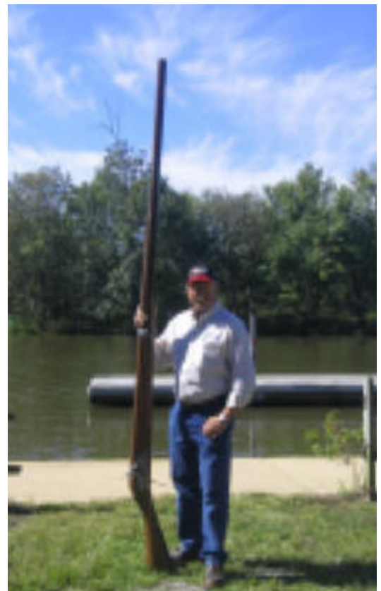
This gun absolutely must be registered. Look at how long it is!

With this issue now over with in Canada, news agencies can move on to more important things like OMG THERE'S SNOW ON THE EAST COAST WTFBQBQ!!!!!!11!!!1!!!!1one!! And OMG SNOW FINALY IN HOUGHTON DEAR LORD. 🐻