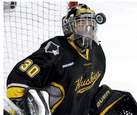
What? I got into MIT? Didn't see that coming. Or this puck for that matter. OH GOD MY FACE.

Believe it or not folks, getting into MIT is a very easy task to do. I know what you're thinking : 'But! But! Their curriculum is so hard, and like, it's so hard to get it! But, at the same time, despite these rumors, MIT is actually not that hard to get into. See, I found this out my senior year of high school. Looking around for schools to apply I chose Cal-Berkley, MIT, and others. Looking for a backup school, I of course chose MIT!